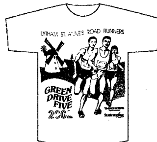
Souvenir coloured t-shirt for every finisher

MEN: James Brearley Shield (three to count) WOMEN: Edwin Booth Shield (three to count)